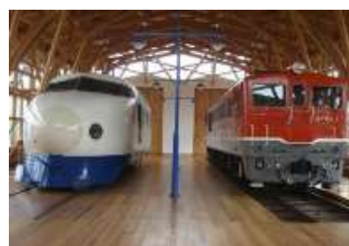
“ Shikoku Railway Heritage Center”

It is for introduction of local history and culture in the Railway of Shikoku Area with display actual models. On the site the memorial hall was constructed in 2007 for the preservation of Shinkansen "0 system" that are the first type of Shinkansen train and "the DF50 form electricity type diesel".