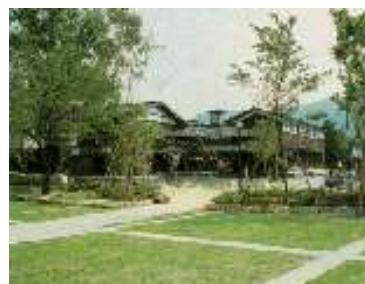
“Hidano Takumi Heritage Center”