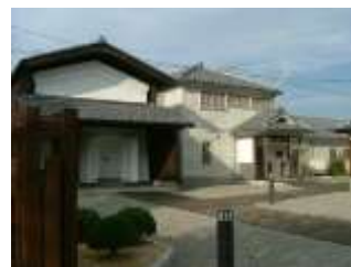
“Murakami Heritage Center”

Address : 7-17, Sannomachi, Murakami-shi, Niigata Open : 9:00am - 4:30pm *Closed on 29 Dec. - 4.Jan. Admission : Adult/JP¥200, Child/JP¥100, JNT member/Free Tel : 0254-53-3666