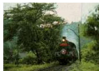
"The Trust Train"

The historic steam locomotive train, carrier of industrial heritage. It runs five times a year under Oigawa Railway Co. A member has to buy a ticket on board.