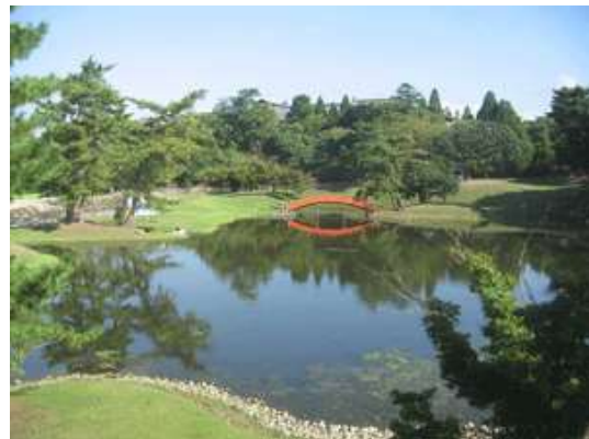
“Old Daijoin Temple Garden”

One of the oldest Japanese gardens, created in the 12th-century, was restored in 1973 by the J.N.T. The garden is located in the northeast of the old capital, Nara-city, and in the area around the garden there are a lot of wooden houses dating from medieval time. This area is called “Nara-Machi”.