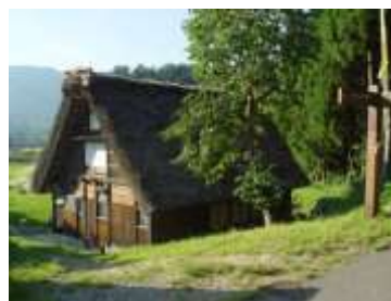
“Shirakawago Gassho style Heritage Center”

Visitors are able to learn about the way of traditional life in Shirakawa village. The historical house is now open to the public in summer season.